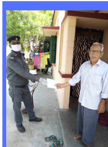
Security Guards distributing pamphlets

Following the protocols & maintaining social distancing in the campus : We are taking all the precautions necessitated by the unprecedented situation Covid-19 has created. To prevent the spread of deadly pandemic 100% lock down is being followed in the campus. Self- isolation/quarantine directives and security guidelines for Covid-19 lock down were released on 22nd March 2020. Awareness pamphlets were specifically distributed to the staff. To ensure the safety of all campus residents, essential supplies are made available in the campus, right from fresh vegetables, fruits and milk to groceries.