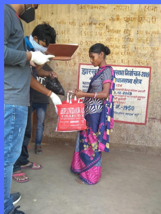
Kartavya members providing basic needs to people.

Kartavya - Dhanbad Chapter has taken up a great step and offered basic needs to the people who lack ration cards with the help of Alumni Funding.