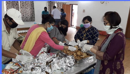
Deepthi Ladies Club of IIT (ISM) Dhanbad packing food for the needy.

The Deepti Ladies Club of IIT (ISM) has been whole-heartedly supporting the Community Services Initiatives team by shouldering responsibilities that come their way.