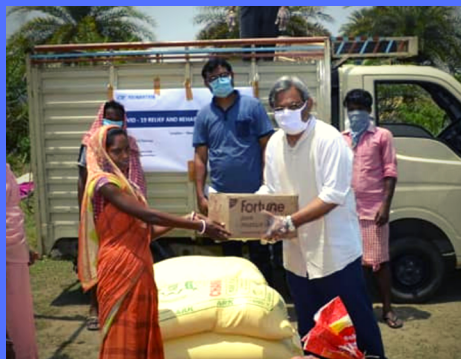
IIT-ISM helps Leprosy hit