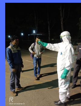
Safety at Main Gate, IIT ISM Dhanbad

Close monitoring of the situation : The Director with his team has been closely monitoring the situation caused by Covid-19 outbreak and accordingly taking decisions in a timely way and constantly updating the students, faculty and staff.